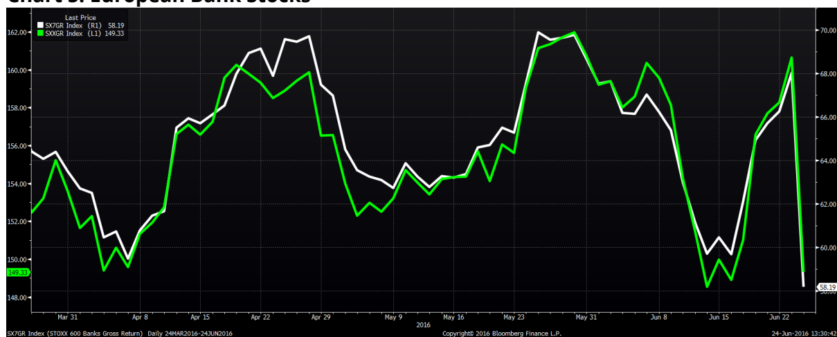
Chart 5: European Bank Stocks