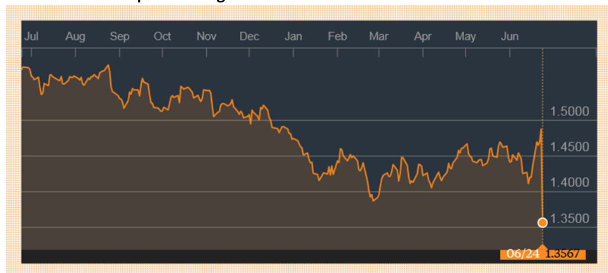
Chart 4: GBPUSD Spot Exchange Rate

The Bank of England is "monitoring developments closely" and has "undertaken extensive contingency planning and is working closely with HM Treasury, other domestic authorities and overseas central banks," to make the transition less painful.