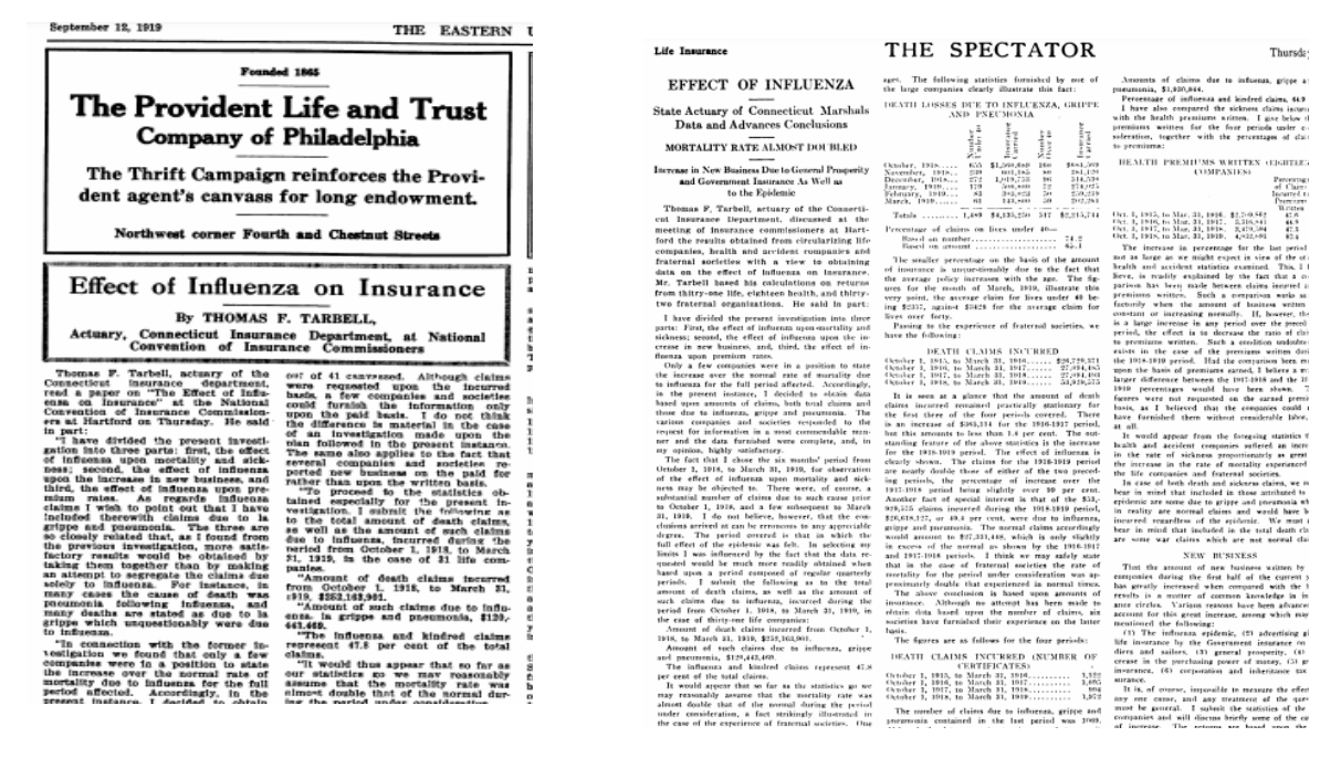
The Eastern Underwriter

Tarbell's report was also widely published and distributed in other insurance publications at the time, such as The Eastern Underwriter (Sept. 12, 1919) and The Spectator (Sept. 18, 1919).