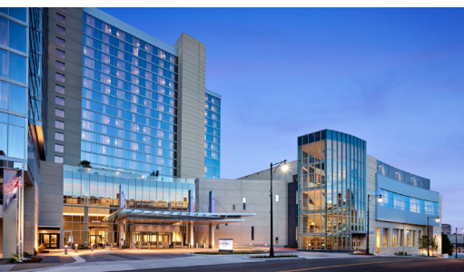
Loews Kansas City Hotel