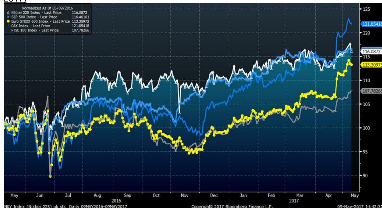
Chart 1: 10-Year Government Yield, Select Advanced Economies (12 Months Ending May 9, 2017)

as other macroeconomic and geopolitical factors held sway; 10-year yields began to rise, and yield curves began to steepen late in 2016, as the one-year to 30-year spread in most major government markets widened significantly on worries that central bank bond-buying programs would wind down, increased fiscal spending would lead to more long-term debt supply, and global inflation would pick up. Thus far in 2017, the major government yield curves have been quite stable. With economic growth expectations in the EU, the UK and Japan, and inflation still shy of central banks' objectives, bond investors expect easy monetary policies and central bank bond purchases to continue for now, keeping a lid on long-term yields.