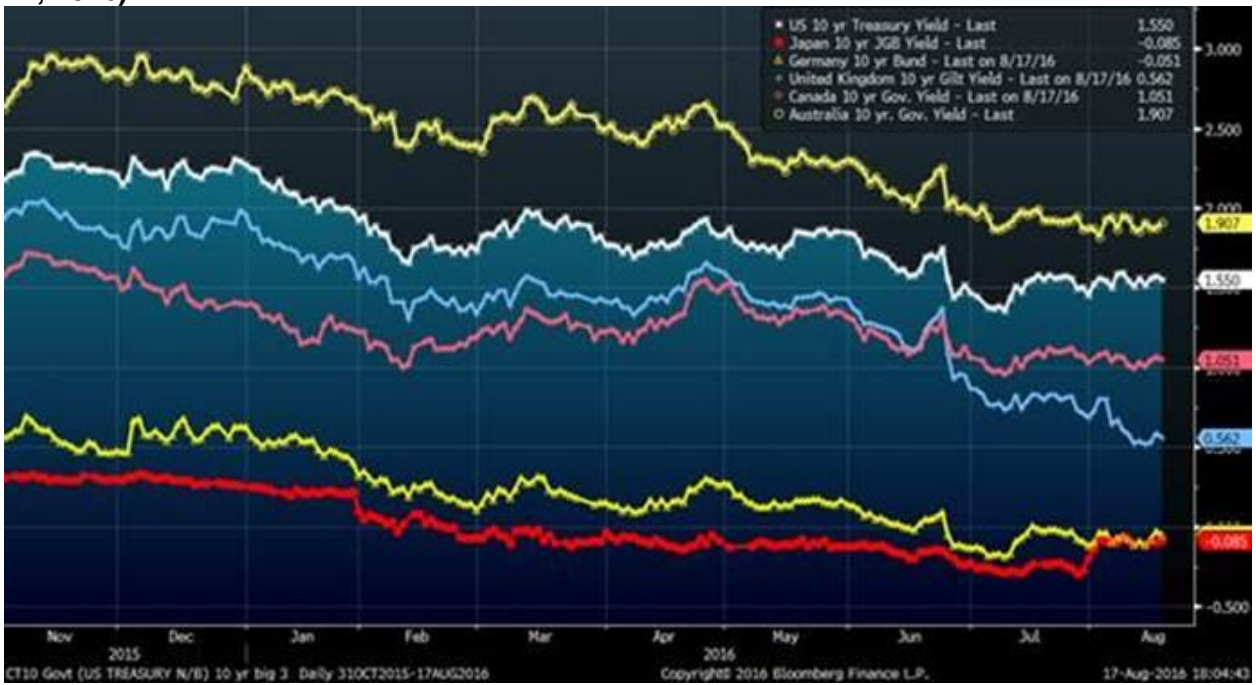
Chart 2 shows the ongoing flattening of yield curves in most major government bond markets over the past two years, expressed by the difference, or spread, between two-year and 10-year yields. Flattening yield curves and low yields are negative for insurers, especially life companies that may offer products with guaranteed minimum benefits..

Chart 1: 10-Year Government Yields, Major Advanced Economies (Oct. 31, 2015 to Aug. 17, 2016)