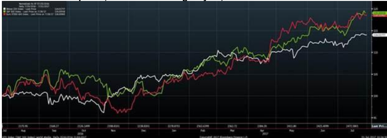
Chart 4: Global Equities, 12 Months Ending July 31, 2017

Most major stock markets have been rising so far in 2017, as shown in Chart 4. The Chicago Board Options Exchange (CBOE) Volatility Index (VIX), which measures expected stock volatility, dropped to its lowest level since 1993 on July 14 and has approached record lows. The U.S. stock market in particular is performing well; the S&P 500 has returned 10.3% YTD (July 31), reaching a record close on July 26. In Asia, stock prices have risen due to rallies in tech giants.