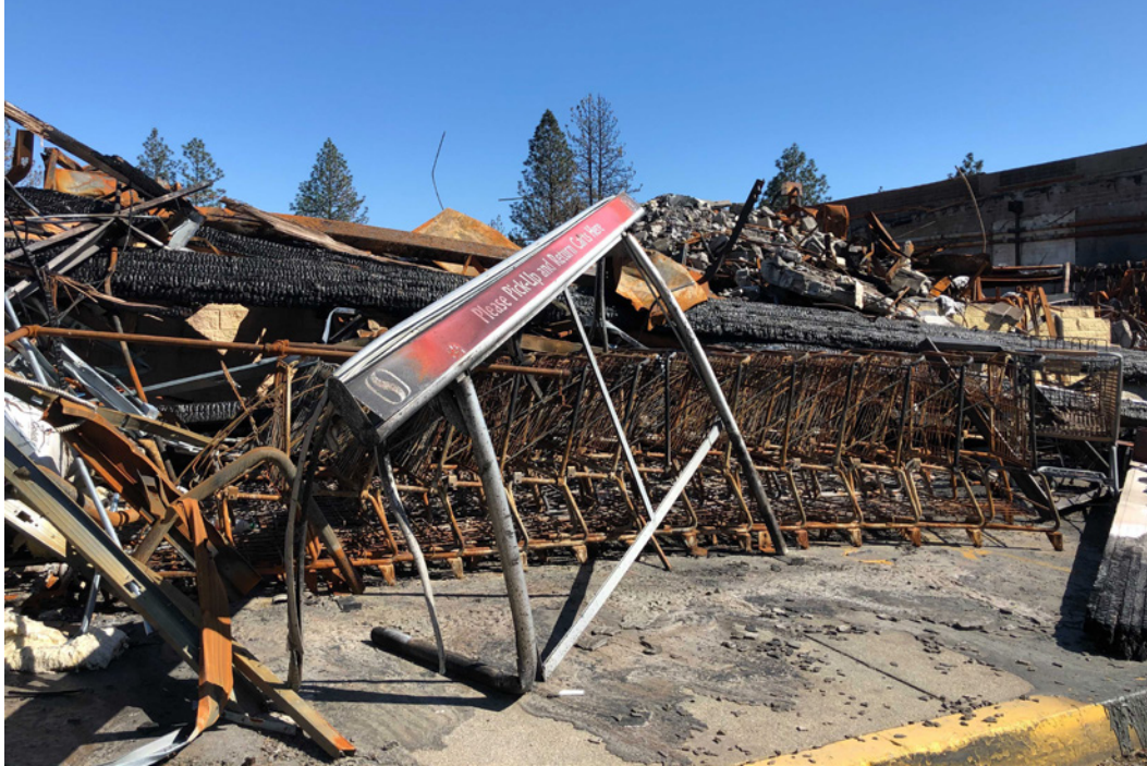
Shopping carts and building remains from the Camp Fire, which destroyed much of the town of Paradise, CA.