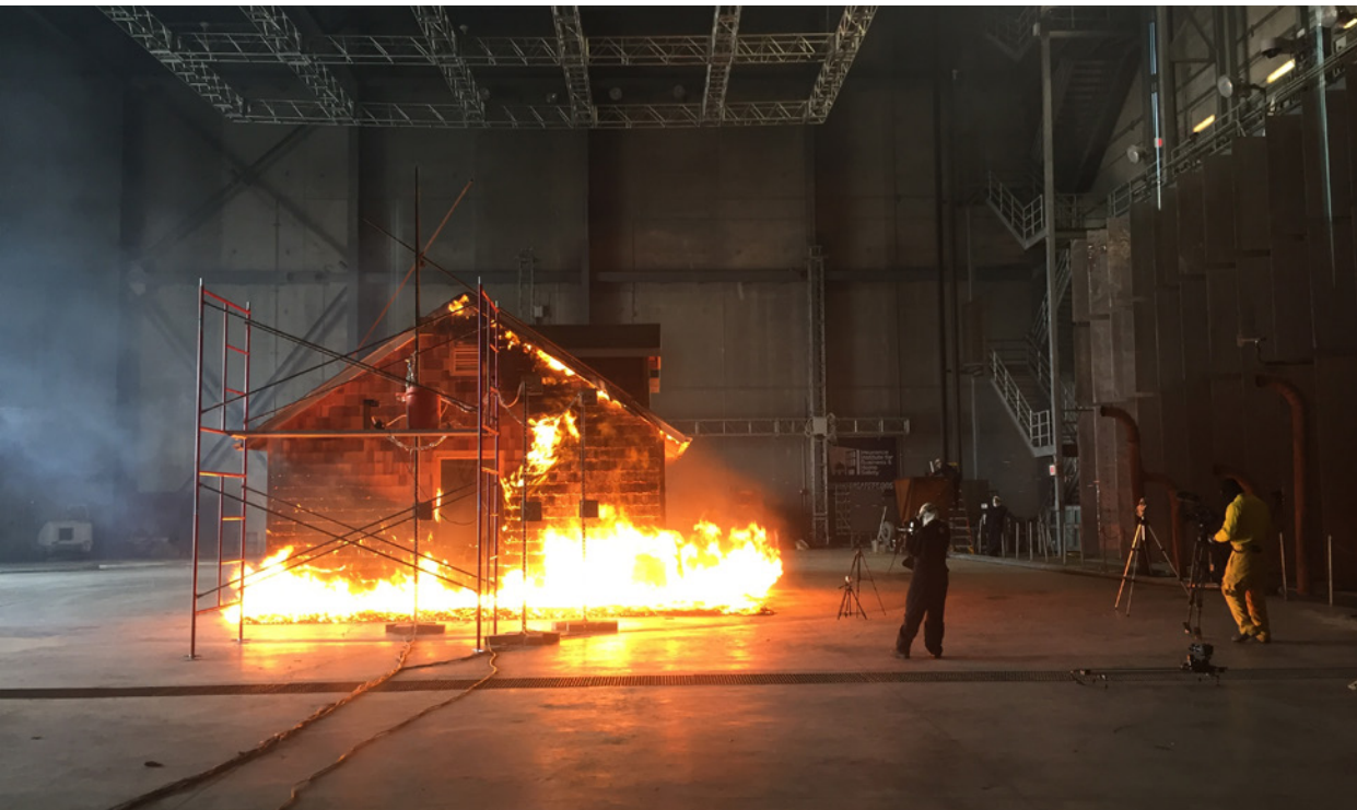
(below) IBHS demonstrates how better building materials can reduce risks from wildfire.