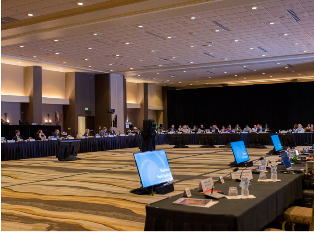
State insurance regulators meet to discuss mitigation programs.

A proposal to create a Catastrophe Model Center of Excellence (COE) within the NAIC's Center for Insurance Policy and Research (CIPR) has been developed. If it's adopted, it will provide resources for state insurance regulators, including access to CAT modeling documentation, technical education and training, and applied research to proactively address regulatory climate-related risk and resilience priorities.