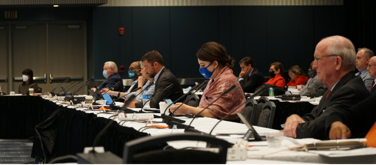
State insurance regulators listen to a presentation on climate-related risks.