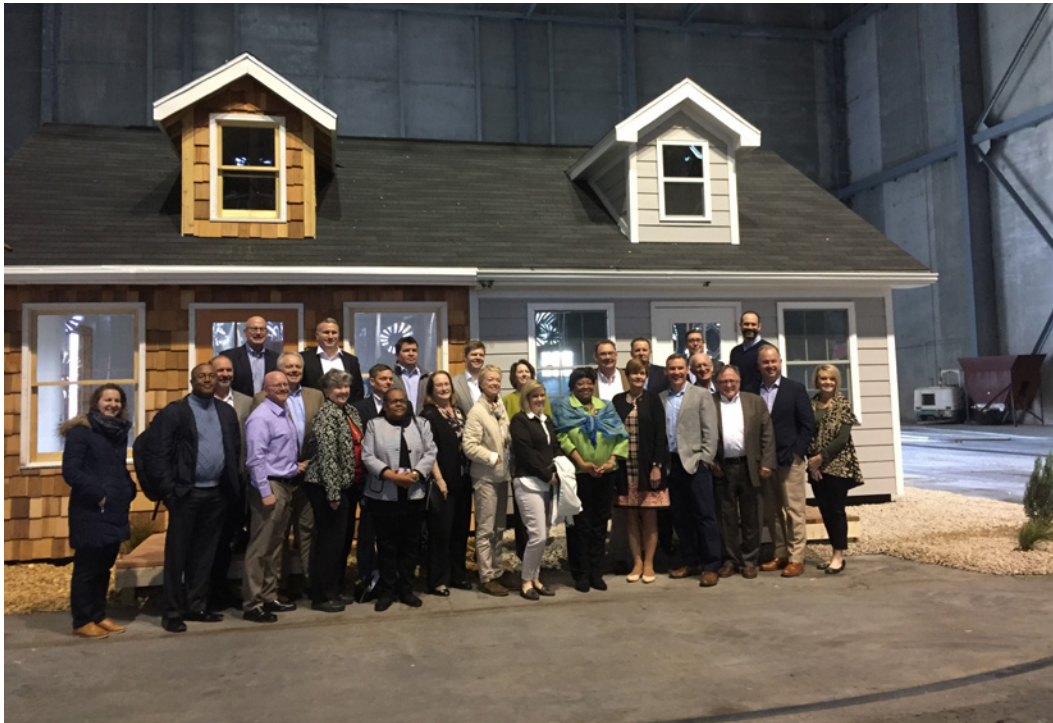
Insurance commissioners visit IBHS to learn about mitigation techniques and FORTIFIED building materials.