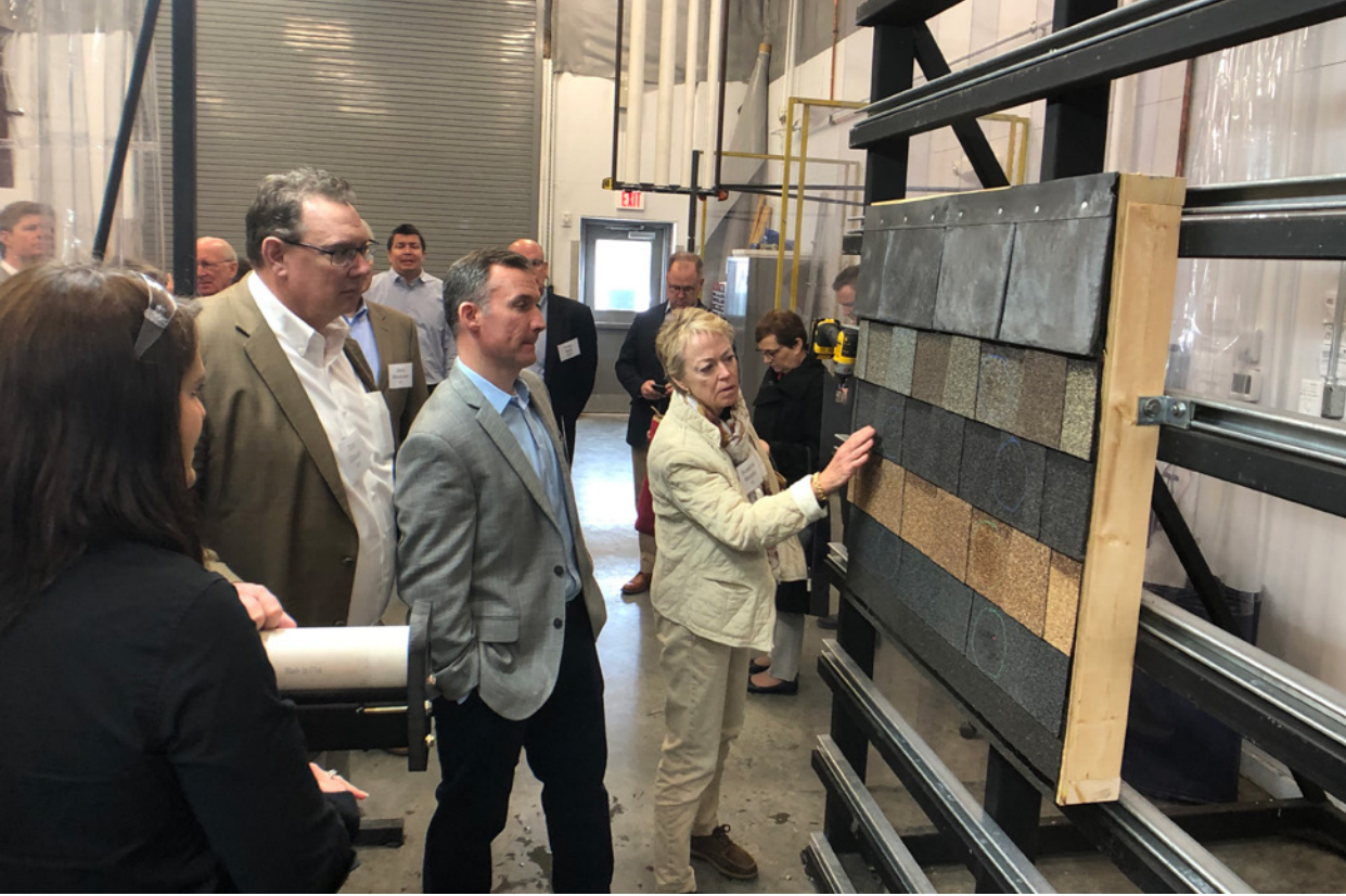
(left) NAIC staff and state insurance regulators review the damage from hail as part of an IBHS symposium.