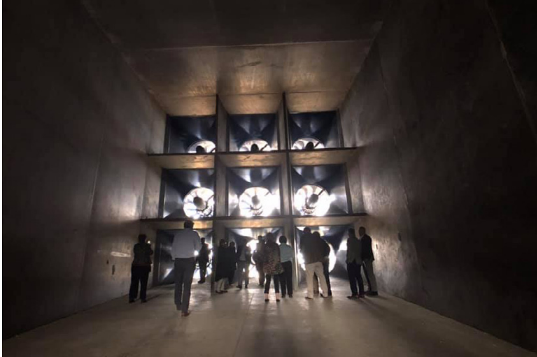
State insurance regulators learn about the impact high winds can have on a structure.