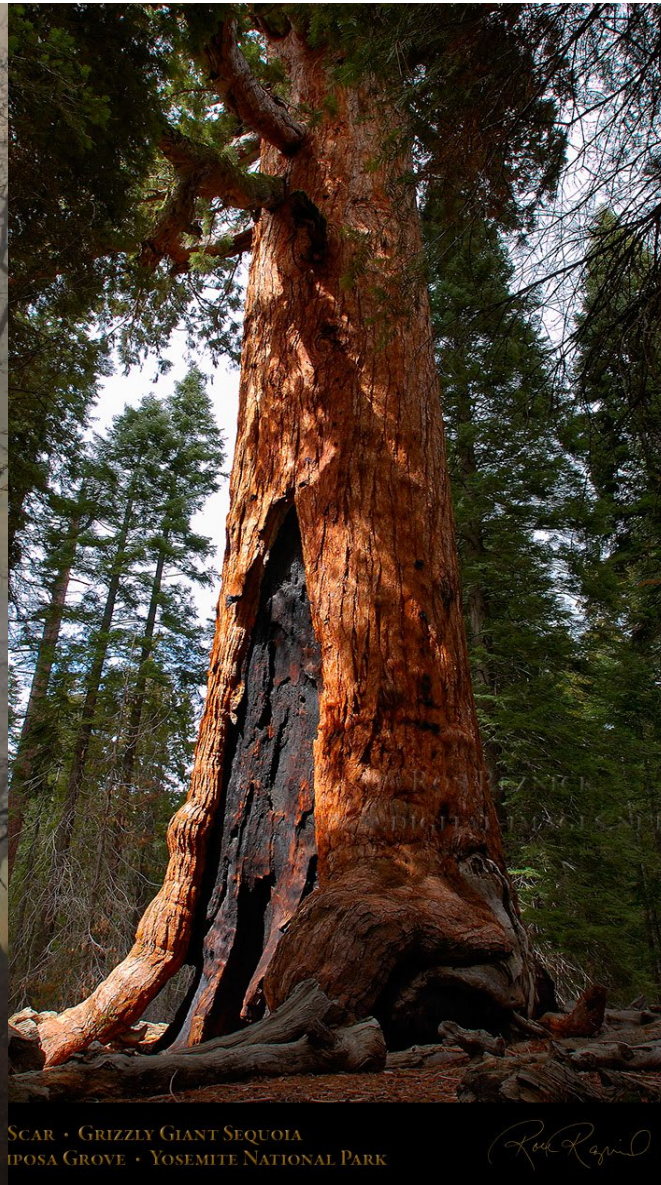
SCAR • GRIZZLY GIANT SEQUOIA IPOSA GROVE • YOSEMITE NATIONAL PARK