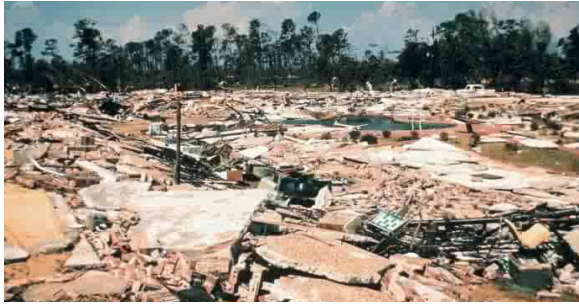
The aftermath of Hurricane Camille.

1964: Great Alaska Earthquake and Tsunami 1965: Flood Control Act of 1965 (P.L. 89-298) 1965: Hurricane Betsy and the Southeast Hurricane Disaster Relief Act (P.L. 89-339) 1966: The Disaster Relief Act of 1966 (P.L. 89-769) 1968: National Flood Insurance Program Hurricane Camille 1969: First NFIP Communities