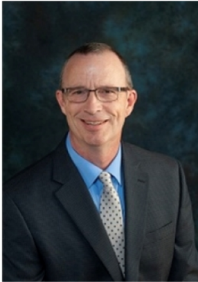
Jeff Rude Insurance Commissioner Western Zone

Jeffrey 'Jeff' Rude was appointed Insurance Commissioner of the Wyoming Department of Insurance by Governor Mark Gordon on September 19, 2019.