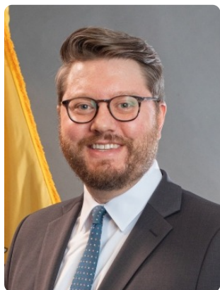
Justin Zimmerman Acting Commissioner Northeast Zone

Term of Office: At the Pleasure of the Governor Appointed: June 27, 2023