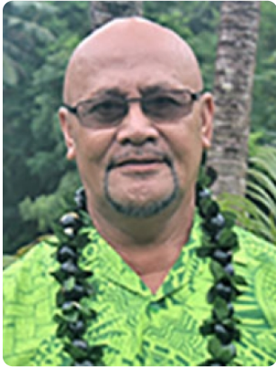
Peni 'Ben' Itula Sapini Teo Commissioner Western Zone

Peni 'Ben' Itula Sapini Teo was appointed Insurance Commissioner by Governor Lemanu Palepoi Sialega Mauga on January 3, 2021.