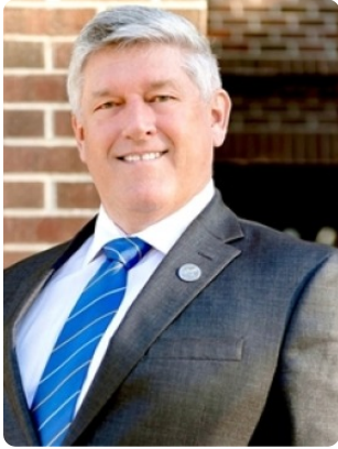
Troy Downing Commissioner of Securities and Insurance, Montana State Auditor Western Zone